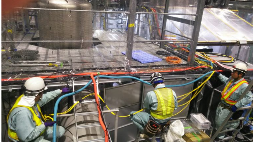
Figure 3: A picture of the fiber installation work around the PR2 chamber in August, 2018. The yellow cables are the optical fibers being inserted into the light blue PF tubing. The black spongy materials are attached to the optical fibers before the insertion.