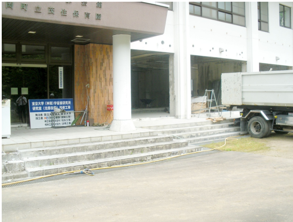
Early June 2012 (Sorry slightly old photos)