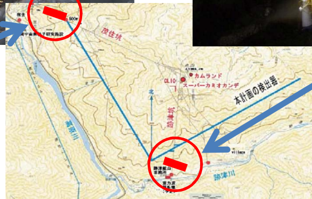
New Atotsu tunnel